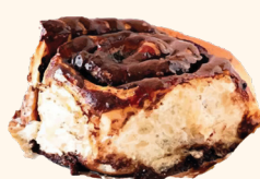
Choc Cin. Roll - 38 K