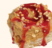
PB & J Cin. Roll - 45 K