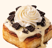
Oreo Cin. Roll - 42 K