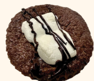
S'more Cookies - 17 K