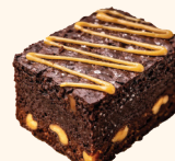
Choc Cashew Brownie - 50 K