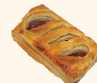
Apple Pocket Pie - 40 K