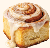
Cinnamon roll - 35 K