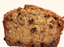
Banana Choc Bread - 37 K