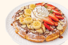
Berry Waffle - 155 K