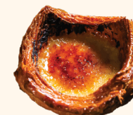
Croissant Brûlée - 45 K