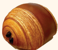
Pain au Chocolat - 52 K