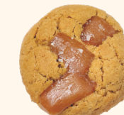
Caramel - 30 K