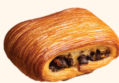
Pain Suisse - 65 K