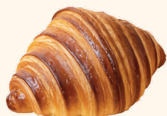
Plain - 48 K