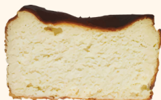
Basque Cheesecake - 78 K