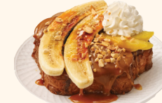
Caramel French Toast - 128 K