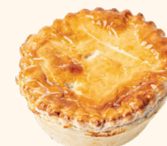
Meat Pie - 75 K