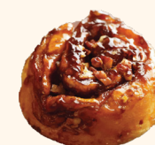
Pecan Cin. Roll - 50 K