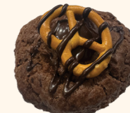
Nutella - 35 K