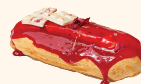
Hibiscus Éclair - 45 K