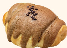
Moka Bread - 30 K