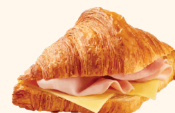
Ham & Cheese - 75 K