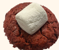
Red velvet - 17 K