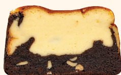
Brownie Cheesecake - 78 K