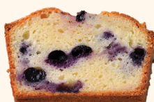
Lemon Blue Bread - 37 K