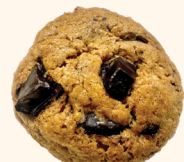
Choc Chip - 35 K