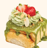
Matcha Cin. Roll - 47 K