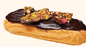
Choc Éclair - 45 K