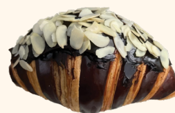
Filled Choc Almond - 68 K