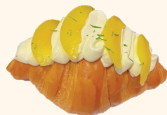
Peach Cream Cheese - 68 K