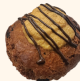
15g PB Protein - 50 K