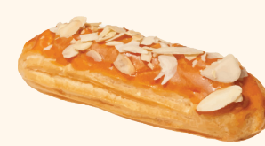
Caramel Éclair - 45 K