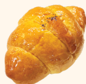
Salted Butter Bread - 25 K