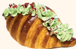
Filled Matcha - 68 K