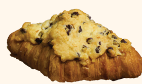
Crookie - 62 K